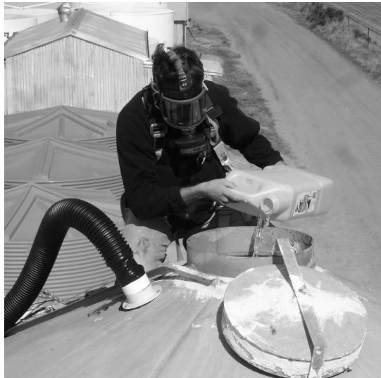
Fig. 2- Pouring liquid Ethyl Formate into the top of the silo.

The control bioassay on R. dominica , S. oryzae , and T. castaneum mixed age cultures in seven-week incubation after fumigation gave the reference population sizes in all stages to the fumigated cultures. This is demonstrated by the existing adult numbers (n) at week 0, and the total new emerging adults numbers from week 1 to 6: (123) 689 R. dominica , (893) 2047 S. oryzae and (356)185 T. castaneum adults. 217 T.variable larvae were removed from the control in week 0 and no further larvae developed from week 1 to week 6.