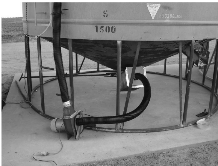
Fig. 1- Fan connected to base and headspace of silo by a 90mm i.d. flexible pipe.

A control group of mixed age insect cultures were established under the same incubation conditions with the treatment group before fumigation and seven-week post-fumigation. The bioassay comparison of weekly counting of insect adults between the treatments and the controls provided the confidence of fumigation efficacy for all life stages.